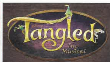
TANGLED: THE MUSICAL Walt Disney Theatre 6:15 pm & 8:30 pm

KEY WEST, FLORIDA All Ashore: 8:30 am All Aboard: 4:15 pm Attire: Cruise Casual