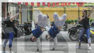
FLIGHT CREW Walt Disney Theatre 6:15 pm & 8:30 pm

DISNEY CASTAWAY CAY All Ashore: 8:30 am All Aboard: 4:45 pm Attire: Pirate or Cruise Casual