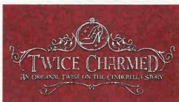
TWICE CHARMED Walt Disney Theatre 6:15 pm & 8:30 pm