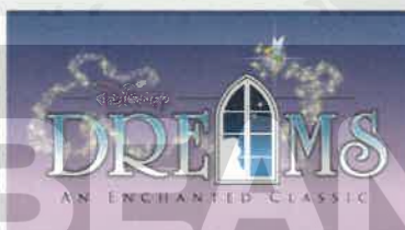
DISNEY DREAMS: AN ENCHANTED CLASSIC Walt Disney Theatre 6:15 pm & 8:30 pm

NASSAU, BAHAMAS All Ashore: 8:30 am All Aboard: 5:15 pm Attire: Cruise Casual